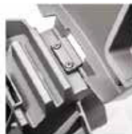
Rational clamshell design for wiring compartment, sturdy and durable.