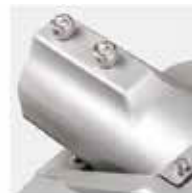
Use stainless steel screws for whole luminaire, no corrosion worries.