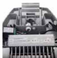
Neat inner cavity structure, ensure the thermal convection of LED driver.