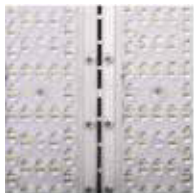
Professional lens design, suitable for various applications.