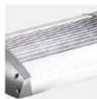
Full aluminum made, sufficient heat dissipation area.