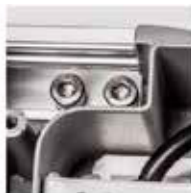
Luminaire body is fixed by two M8x16 fortified stainless steel screws.