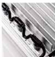
Innovative pluggable connector, clean & efficient.