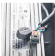
Use German WAGO connectors for internal wiring, safe, convenient & fast.